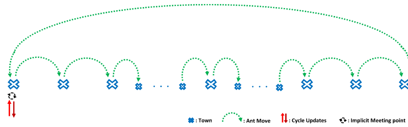
Figure 2. Illustration of the Ant-Cycle model.

increases the ants' reactivity. Effectively this second model provides, for ants, an efficient disseminating data process in the system by depositing, adequately, the needed data and increases consequently their reactivity.